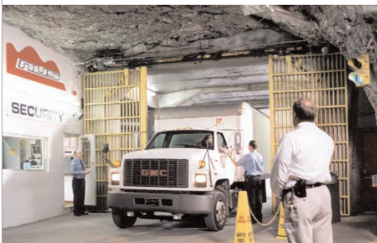
National Underground Site (NUS) facility provides unsurpassed Data Center security

The Iron Mountain Backup for PC solution provides the highest levels of digital security available. Data is encrypted at the desktop, using government-level, 128-bit, Advanced Encryption Standard (AES). All desktop and laptop data is kept encrypted both during transmission and in storage.